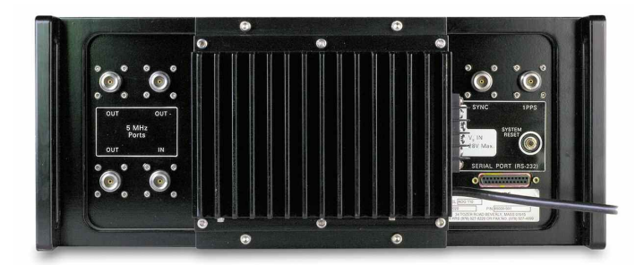
The AOG-110 is used by calibration laboratories, engineering facilities and metrology laboratories with high stability frequency standards such as Masers to generate high quality RF sine wave signal offsets without sacrificing performance.