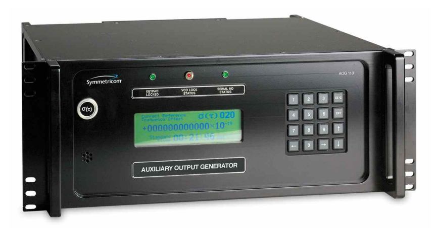
AOG-110 Auxiliary Output Generator

The output frequency is controlled by directly offsetting a phase accumulator (synthesizer) in the PLL chain. The maximum synthesized fractional frequency range is ±1E-7, with a fractional resolution of 1E-19. By altering the frequency output over a precise time interval, output phase control is achieved. Typically, the user defines the desired phase offset and time interval within which the offset is made. Once set, the AOG-110 automatically implements the appropriate frequency offset and precise time interval. Direct control over both frequency and time interval is available.